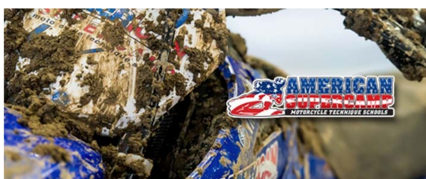
Coming from a dirt bike background this is my kind of school

The American Supercamp School has specific lessons for street riders, road racers, flat trackers, motocrossers and supermoto. The lessons are grouped into these categories because the school understands that different riders have different needs. You're therefore guaranteed of getting the skills in your area of specialization.