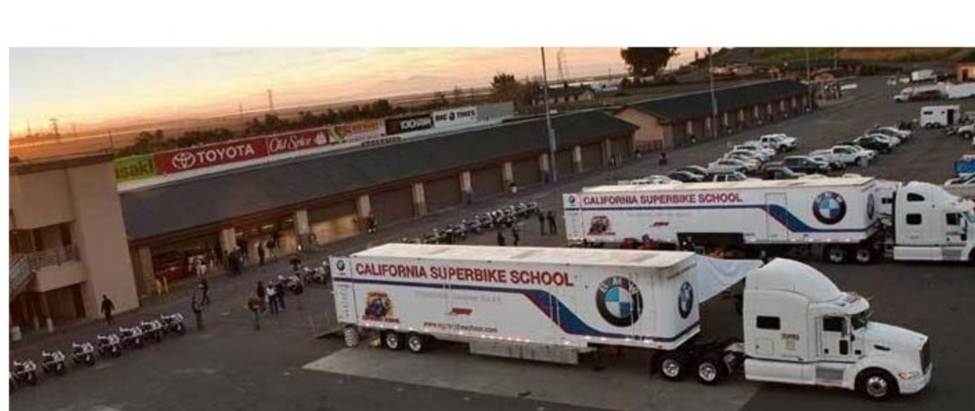
California Super-bike School will take your riding skills to new heights

For a start, the California Superbike School doesn't have classes for beginners. The learners start from level one all the way to level four. At level one, students are taught how to overcome common mistakes that are often made by riders.